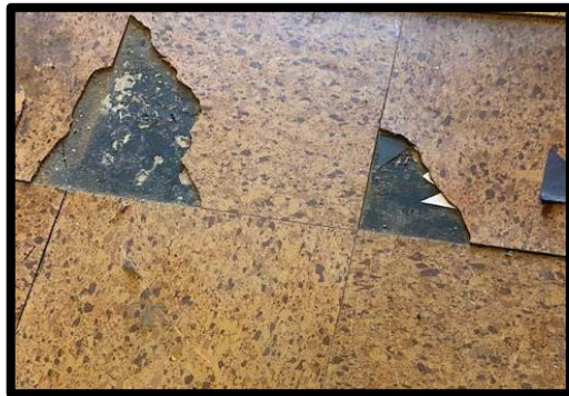
HGA #3- 9x9 Orange Floor Tile with Black Mastic. Hazard in Kitchen Pantry.