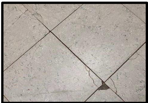
HGA #6- 9x9 White with Green Floor Tile. Hazard in Pre-K Room.