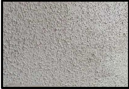
HGA #2- White with Gold Speckled Ceiling Texture. Hazard in Maintenance Room.