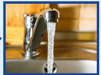
Piping & Plumbing

Water travels from wells or surface water intakes to municipal water systems for treatment and distribution to households and schools. Some water comes from piping connected to a well at the same location.